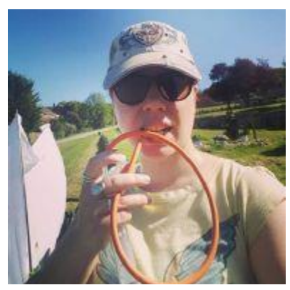
How to use a pooter

Of particular interest to us was a comparison between Shaw Cemetery and our cemetery. She has found eleven families of beetles in Newtown Road Cemetery, only five at Shaw; 107 individuals compared to 88. So now she has to look at the differences between the two sites. The obvious ones are surrounding land use and density of graves. In both these cases you might predict that Shaw would be more welcoming for flying beetles — more space to fly, fewer buildings surrounding but that is not the case. Another difference is that NRC is managed for wildlife and Shaw is not. Our cutting